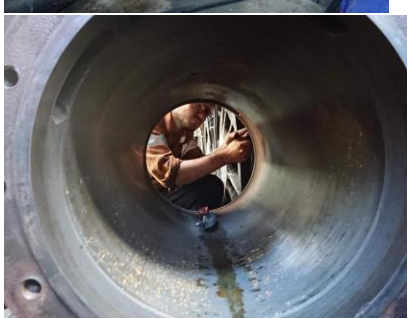
ZigZag Railway Images....Tree removal, Simon checking 218A brakes & 218A's fireman's side cylinder