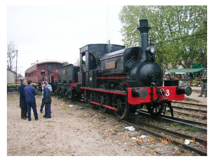
Nigel Hunt: Uruguay Photos.. Manning-Wardle no.3 and Beyer-Peacock no.119.

fought in two world wars. For a century, from 1850 to 1950, steam locomotive haulage dominated Australia's various rail systems and, during that period, rail networks expanded from a few short routes in the big capital cities to huge networks reaching every corner of each state. The book also covers the great named express trains hauled by steam locomotives over the decades: Puffing Billy, Robert Gordon Menzies, The Ghan. Special features include information on Albury's 'break of gauge' platform (where two state track systems met), the Amiens branch line (running through Pozieres and Passchendaele stations in Queensland), the 'garnishee' order against the Spirit of Progress, some important characters such as C.Y. O'Connor and many, many more fascinating topics."