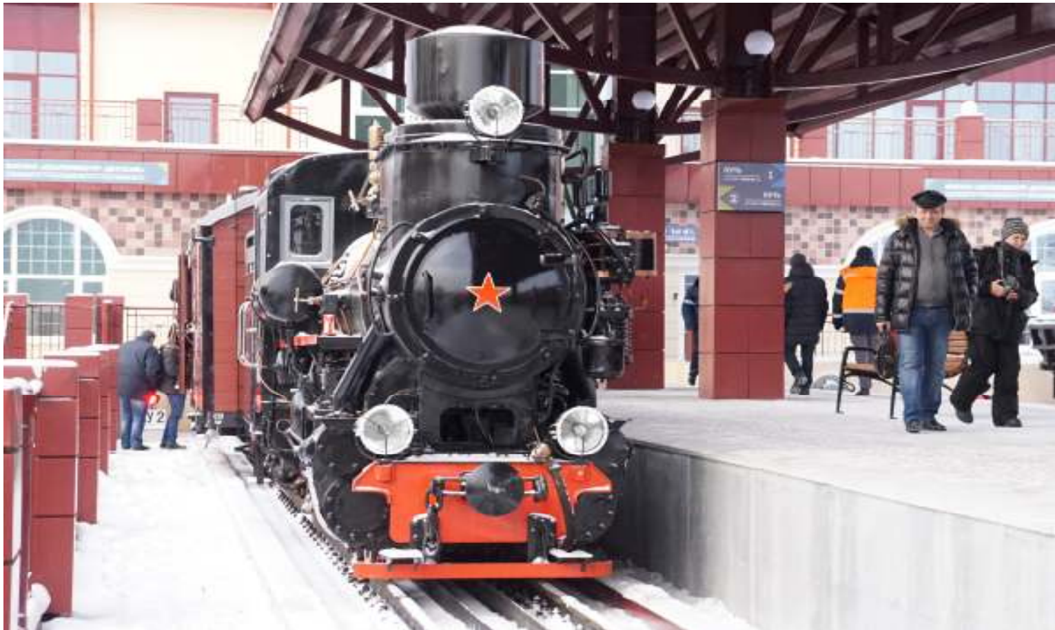
No VP-4 1425 restored to working order, on view at Ekaterinburg in February

It will be particularly gratifying to our members to learn of the All-Russia Forum which met recently in Ekaterinburg, because it was a wish to help Russian preservation in the early post-soviet years that gave birth to the UK group that later became NERHT. Since that time the pioneer Pereslavl' enterprise has survived and developed, in often